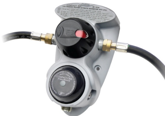
Figure 1. Compact 800 Valve assembly