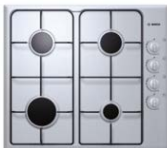
NGU4151DB - Bosch FD 8901 - 9110