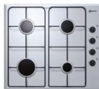
T20S31N0 - Neff FD 8901 - 9110

BSH Home Appliance Ltd (BSH) has initiated this precautionary measure as, during comprehensive product monitoring and detailed research, BSH identified a potential issue regarding the gas connectors. In particular circumstances the gas connector can crack or break, which could result in an escape of gas.