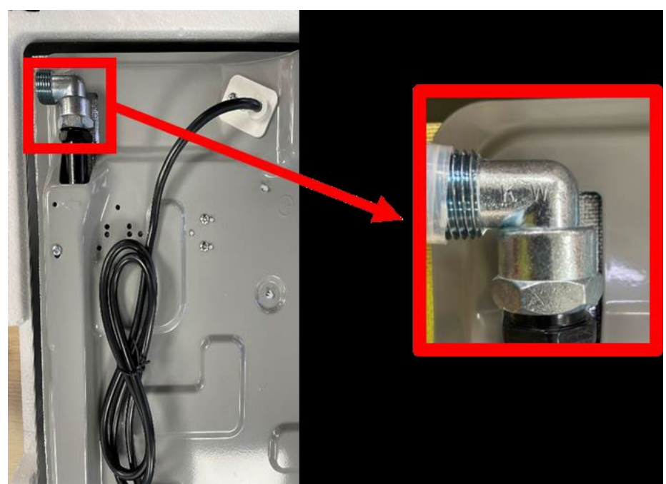
Figure 1 Gas inlet elbow original position on appliance

Belling have identified a potential issue with the silver gas inlet elbow connector on some gas hobs breaking when installed in holiday caravans, lodges, and park homes. If the inlet elbow is as shown in Figure 1, then the elbow <u>must be replaced.</u>